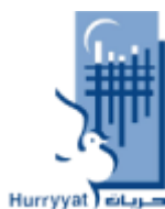
Hurryyat - Centre for Defense of Liberties and Civil Rights