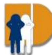
Defence for Children International Palestine Section