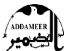
Addameer Prisoners' Support and Human Rights Association