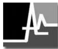
Badil Resource Center for Palestinian Residency and Refugee Rights